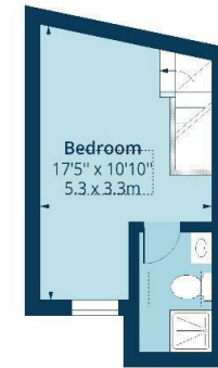
First Floor Floor Area 191 Sq Ft - 17.74 Sq M