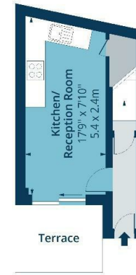
Ground Floor Floor Area 183 Sq Ft - 17.00 Sq M

Approx. Gross Internal Area 374 Sq Ft - 34.74 Sq M